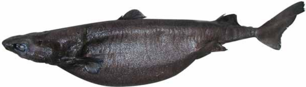
Fig. 2 - Etmopterus princeps MMF36113, 671 TL.

Material examined : MMF 23656, 22-08-1984; 709 mm TL female caught with bottom longline at 1,620 m depth in Funchal Bay; MMF 23657, 14-08-1984, two specimens, 654-702 mm TL, females caught with bottom longline ca. 1,200-1,500 m depth in Funchal Bay; MMF 23658, 23-08-1984, two specimens, 695-706 mm TL, females caught with bottom longline ca. 1,700 m depth in Funchal Bay; MMF 36086, 655 mm TL; MMF 36099, 472 mm TL; MMF 36101, 460 mm TL, all females caught with bottom longline at 2,000 m depth in Funchal Bay; MMF 36088, 543 mm TL; MMF 36138, 565 mm TL; MMF 36143, 576 mm TL, all males caught with bottom longline at 1,500 m depth in Seine Seamount; MMF 36093, 622 mm TL; MMF 36103, 570 mm TL, both males; MMF 36096, 620 mm TL, female, caught with bottom longline at 1,500 m depth in Unicorn Seamount; MMF 36113, 671 mm TL; MMF 36114, 493 mm TL, both females caught with bottom longline at 2,000 m depth in Unicorn Seamount; MMF 36125, 487 mm TL, female caught with baited fish traps at 2,000 m depth in Unicorn Seamount.