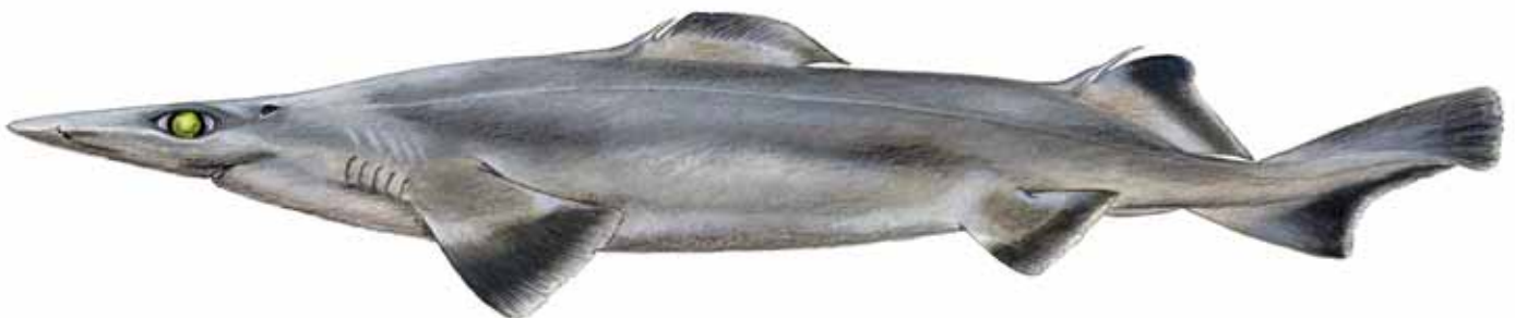
Fig. 4 - Deania profundorum MMF36063, 551 mm TL (Drawing by Helena Encarnação).