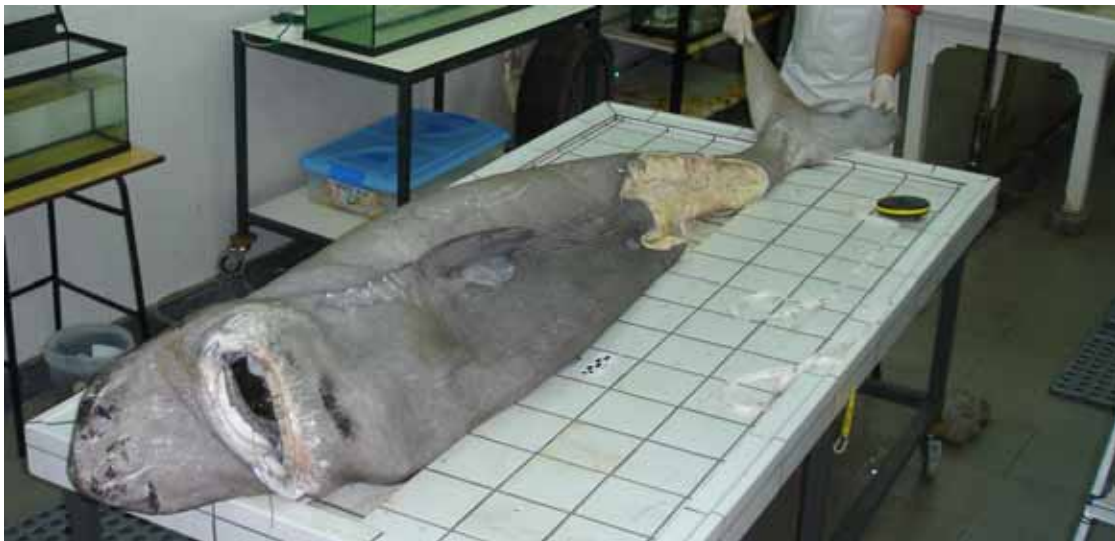
Fig. 5 - Somniosus microcephalus (MMF36218, 3,140 mm TL) at the wet laboratory of the Marine Biology Station of Funchal.

Material examined: MMF 23429, 19-10-1983, just the head, caught by R/V Challenger in Funchal Bay; MMF 36218, 13-07-2005, 3,140 mm TL, male caught with bottom longline at 1,000 m depth in Funchal Bay.