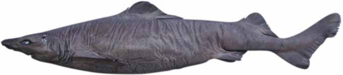
Fig. 3 - Centrophorus niaukang MMF36027, 1,327 mm TL.

Material examined : MMF 36027, 1,327 mm TL, 25-10-2004, female caught with bottom longline at 1,000 m depth in Unicorn Seamount.